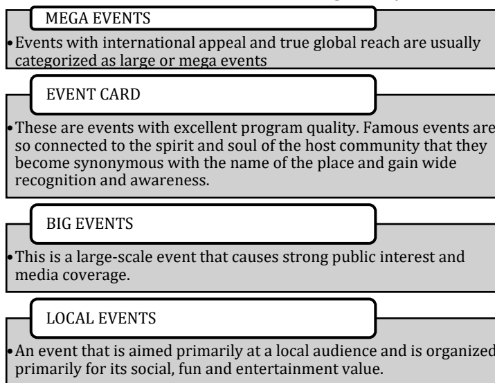
Fig. 2. Classification of events by size and scale

Events are divided into four categories by size and scale (Fig. 2):