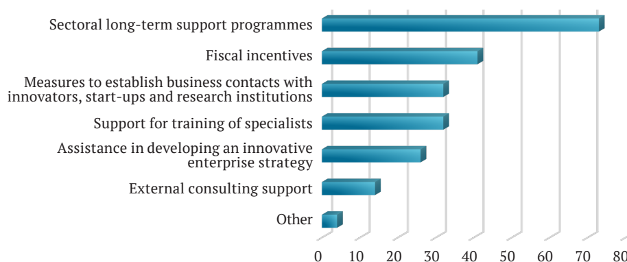
Figure 3. Desirable factors for stimulating investment and innovation activities for Ukrainian enterprises (% of responses of the surveyed enterprises)

Almost three-quarters of companies note that they need special long-term support programmes at the industry level. Many firms need specific financial (including tax) incentives and support measures to establish contacts with relevant innovators. In addition, one-third of companies need support in training relevant specialists in this area. At the same time, there is a high level of uncertainty, meaning that companies are unable to determine what exactly can stimulate their innovation activities in the current and future environment (Fig. 3).